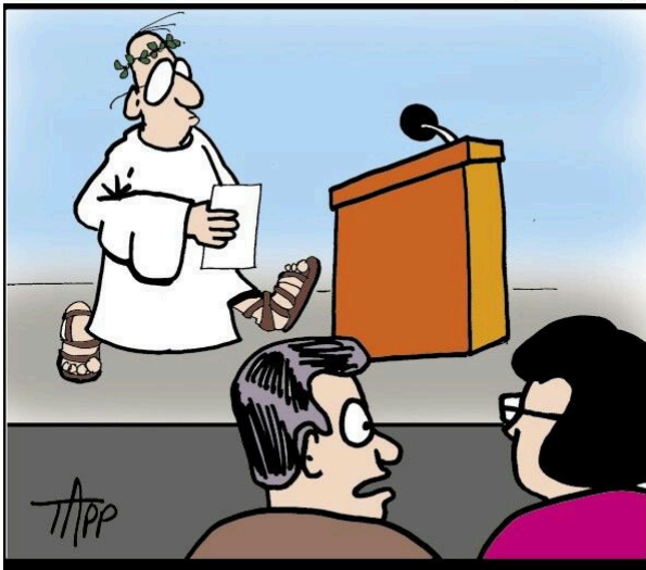
"You can always tell when he's going to preach from the book of Romans!"